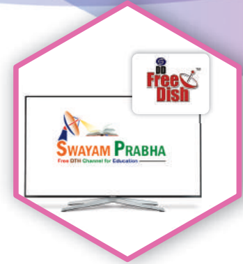
Live Broadcasting of SWAYAM Prabha Channels

One small size DTH Dish Antenna along with LNB (Low Noise Block) and Feedhorn