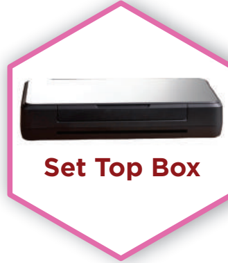
Set Top Box