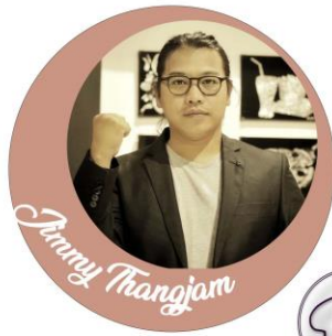
Founder, Tweak Learning